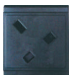
45 Degree UK Socket