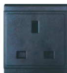
90 Degree UK Socket