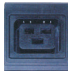
IEC C19 Socket