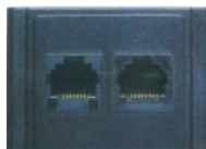
Rj45 Data Socket